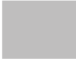
Medium Gray 5700MG1 one gallon 5700MG5 five gallon