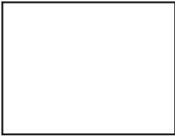
White 5700W1 one gallon 5700W5 five gallon

Available in a variety of colors including: