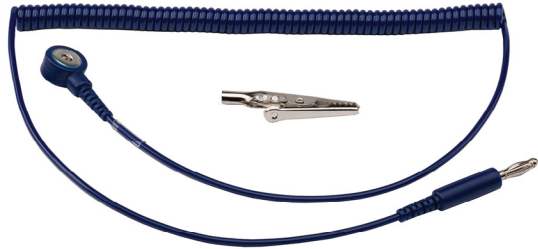
Product# 8101 6 per pack