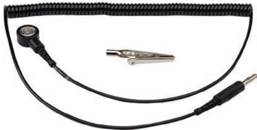
Product# 8107 6 per pack