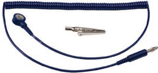
Product# 8101 6 per pack