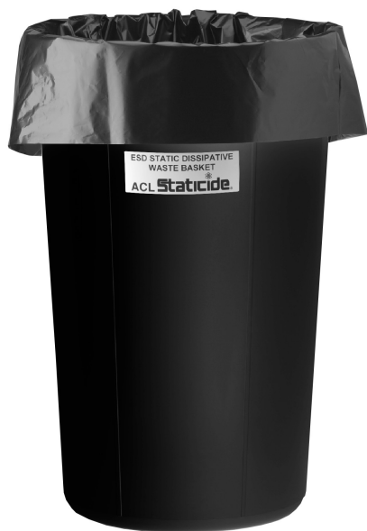
Pictured: #5074 Wastebasket with #5076B Liners